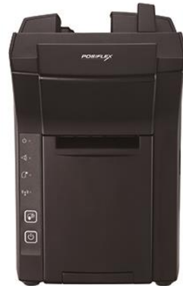
Docking Station + Printer